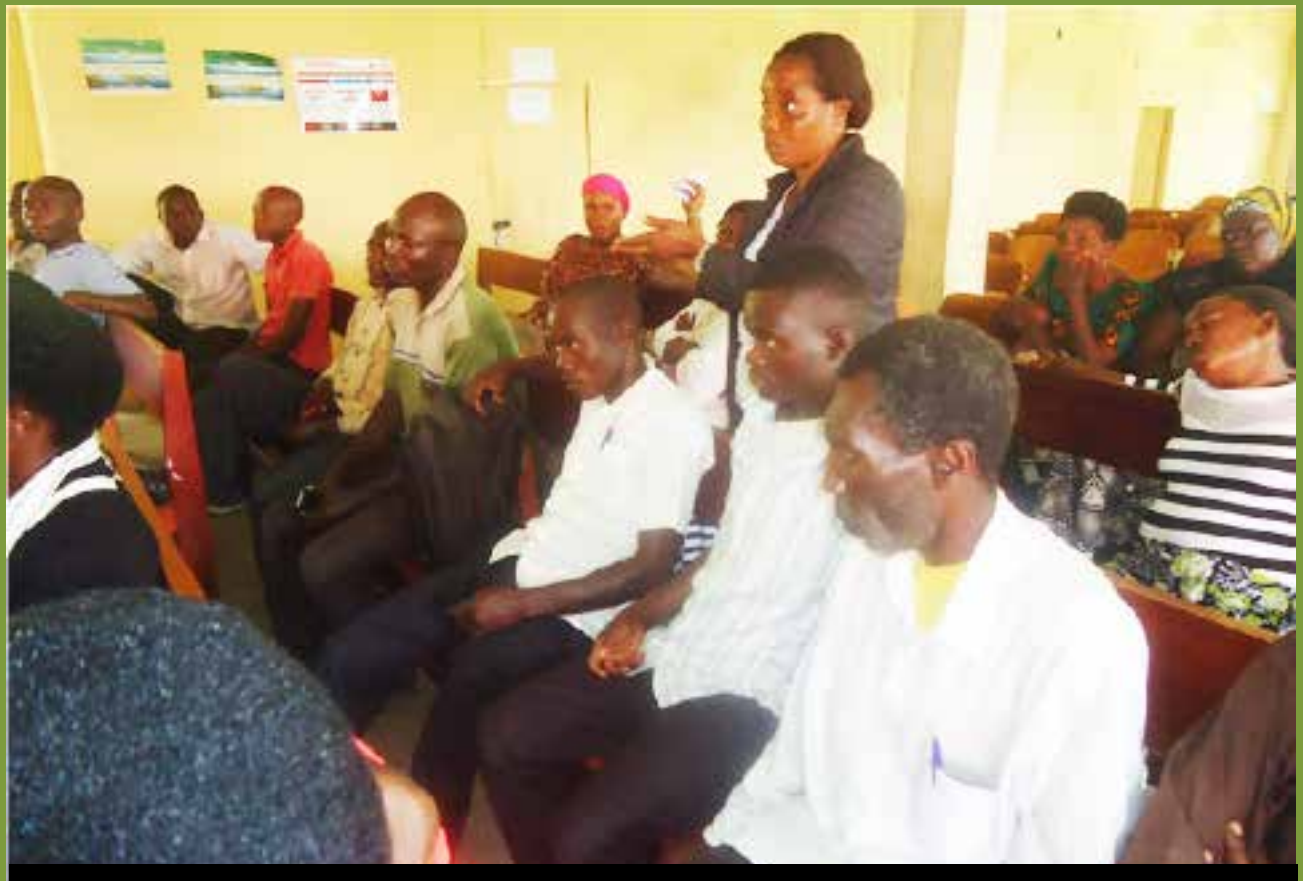
CDO addressing special interest group leaders at Karugutu Town council offices in Ntoroko district

13. Community meetings between the sub county and local council leaders and monitors: a total of 63 round table meetings were conducted across the 63 sub-counties of the 8 districts in the Rwenzori region where RAC operates. As a result, a platform for the communities and their leaders to engage on service delivery and corruption issues within their locality was created. In these meetings, a total of 450 issues were presented to leaders for response, out of which 154 were responded to, and the remaining 296 taken up for further investigations