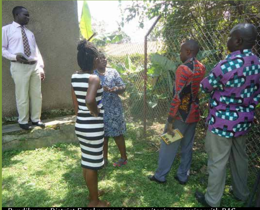
Bundibugyo District Focal person in a monitoring exercise with RAC staff and other leaders

total of 8 District Focal Persons were recruited to support the secretariat at district and sub-county level. 63 RAC branches were supported by the focal persons in monitorevidence-based ina and reporting. The focal persons further attended various district council sessions and other sector committee meetin their respective ings districts. In addition, a total of 43 cases were followed up by the focal persons with various duty bearers for response and action.