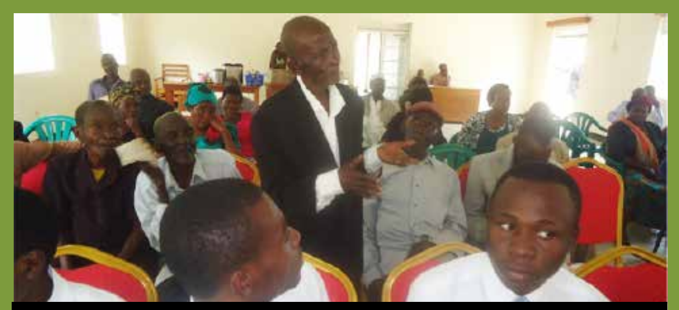
Meeting with the leaders of special interest groups in Bundibugyo district

5. Meetings with Leaders of Interest groups: A total of 8 meetings (one per district) were conducted with interest groups leaders to ascertain how service delivery affects categories of groups in terms of gender. These groups included youth in and out of school, Women, Elderly persons and People with disabilities. Through these meetings, a critical mass in the fight against corruption was built by bringing on board interest and marginalized groups in RAC's mainstream reporting. A total of 424 persons participated in these meetings i.e. 181 women, 243 men, 79 youth, 93 elderly persons and 68 PWDs. From these meetings, a total of 51 issues were raised for response and action by the relevant duty bearers.