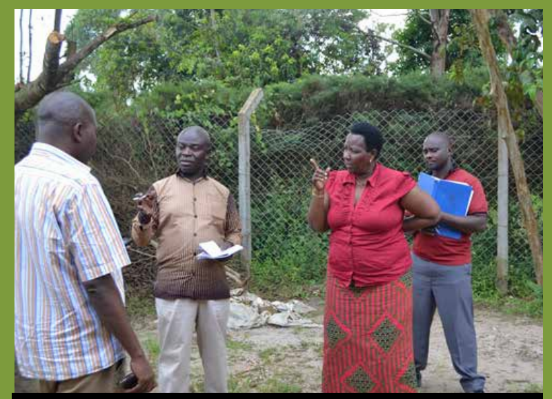
Joint monitoring on Kaija Swamp in Kyegegwa district with the _____ Kyegegwa district leadership

A total of 24 social audits were conducted throughout the region in the year 2018. The audits/joint monitoring activities were done between RAC and other local leaders including councilors, members of the District Public Accounts Committee (DPAC), political leaders and technical staff. This initiative has led to quick action on cases and collective action and decision making by leaders.