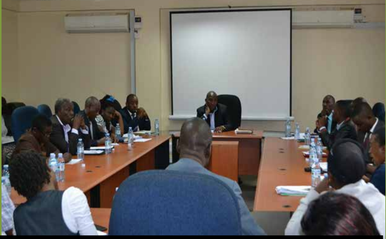
Kabarole District RDC Chairing the DIPF in Fort Portal - Kabarole district

8. District Integrity Promotion Forum (DIPF) meetings: a total of 24 DIPF meetings were conducted in the period under review, bringing together a total of 307 leaders i.e. 201 Men and 106 women to address issues presented from sub-county meetings ,monitoring reports and interest groups meetings. The meetings further sought to undertake bi-annual review of the extent of implementation of the District Public Accounts Committees (DPAC) recommendations.