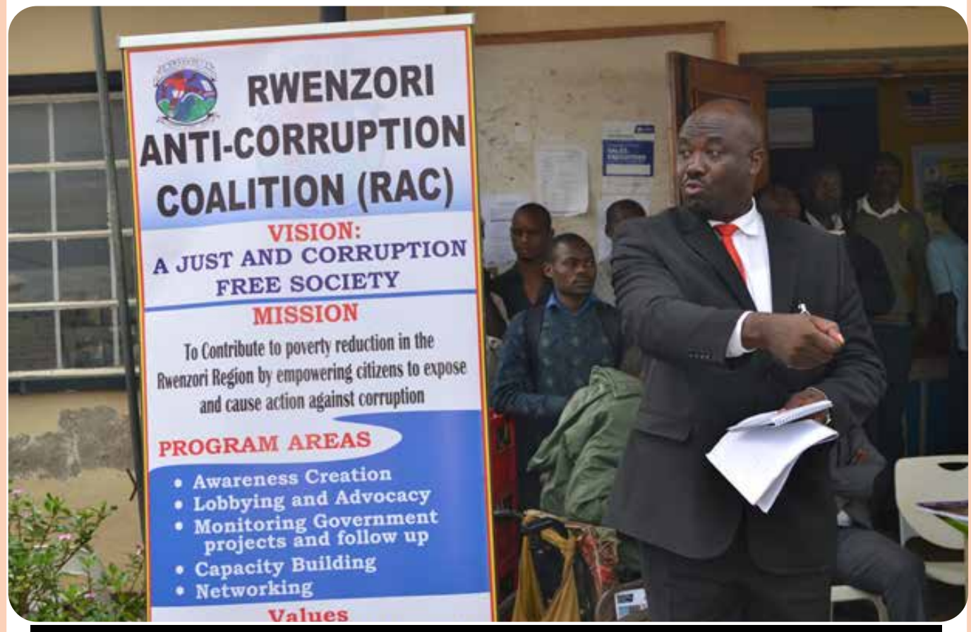
Kabarole District Chairperson responding to community concerns during a public dialogue in Fort-Portal

ACFIM : RAC in partnership with ACFIM mobilized citizens and Members of parliament to promote and understand the importance of having in place a campaign finance Act to regulate election financing during election processes