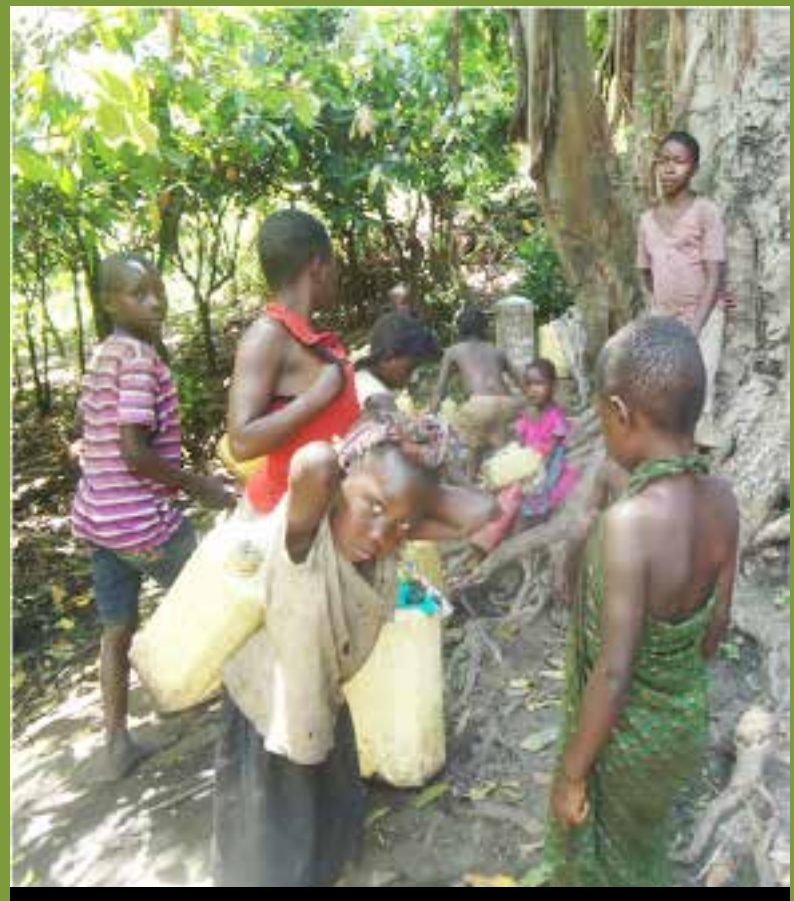
Children fetcching water at Burondo GFS Bundibugyo district

2. Project inception meetings: Eight inception meetings (one per district) were jointly conducted with RAC, KRC and Kind Uganda. Showcasing team work, solidarity and collective voice on governance and service delivery issues were some of the achievements realized from the inception meetings. The initiative of joint implementation of activities was appreciated by the leaders since greatly limits duplication, it strengthens team work, ownership and collaboration with CSOs and government.