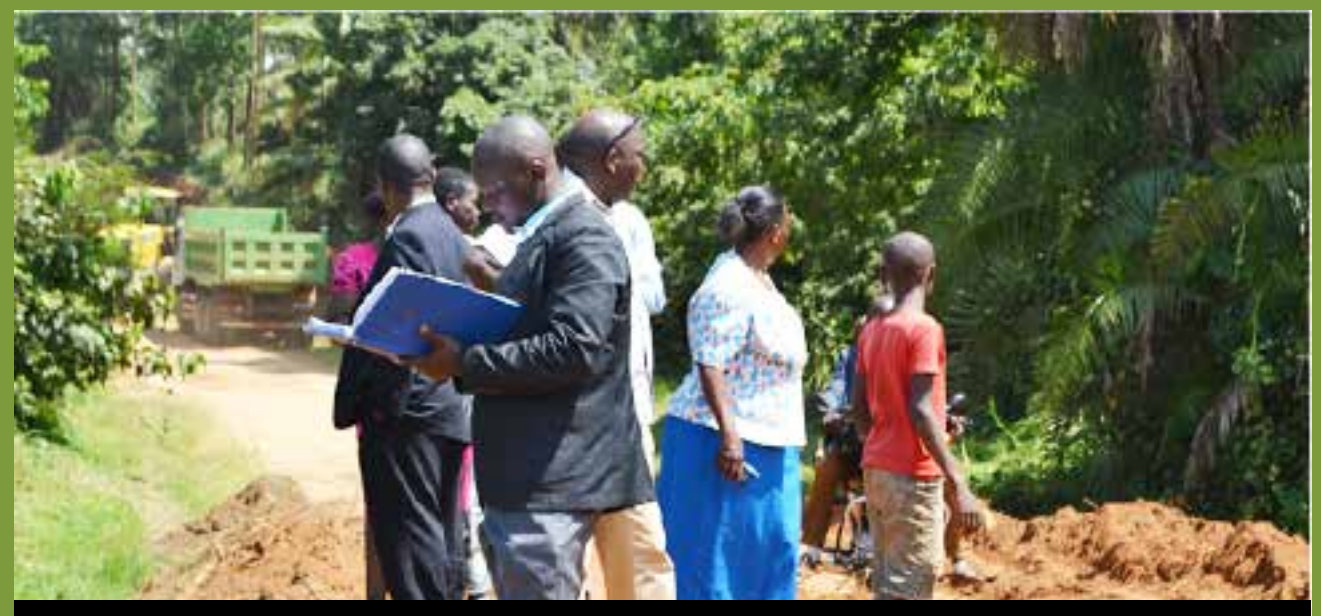
Joint monitoring on Kaija Swamp in Kyegegwa district with the Kyegegwa district leadership

4. Follow up of cases reported by monitors and feed back to communities through community meetings: a total of 156 monitors' reports with a total of 480 issues were reported to RAC and presented to the relevant bodies for response through various avenues including meetings with duty bearers, sub-county conferences, District Integrity Promotion Forums social audit and joint monitoring of projects. Feedback to the communities about the cases reported was given through the feedback meetings conducted in the 63 sub-counties. Through follow up, a total of 314 cases were concluded out of the total 899 cases reported to RAC throughout the year. In addition, the feedback given to the community brought them up to speed with the cases reported to RAC to keep them in the know