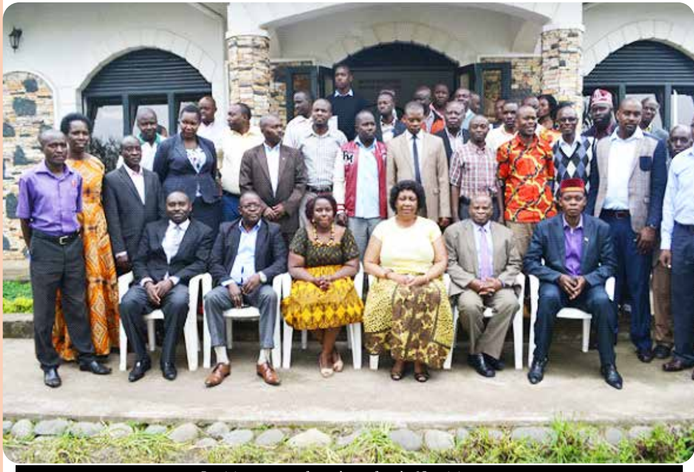
Participants pause for a photo after the IG training

Organized by the Inspectorate of Government, the training was a country wide program geared towards enhancing CSOs to fight corruption. RAC was particularly selected out of the so many CSOs in the region because of her willingness and capacity to organise, carry message forward and train communities. Members of the governance cluster were also invited to participate in this very important training.