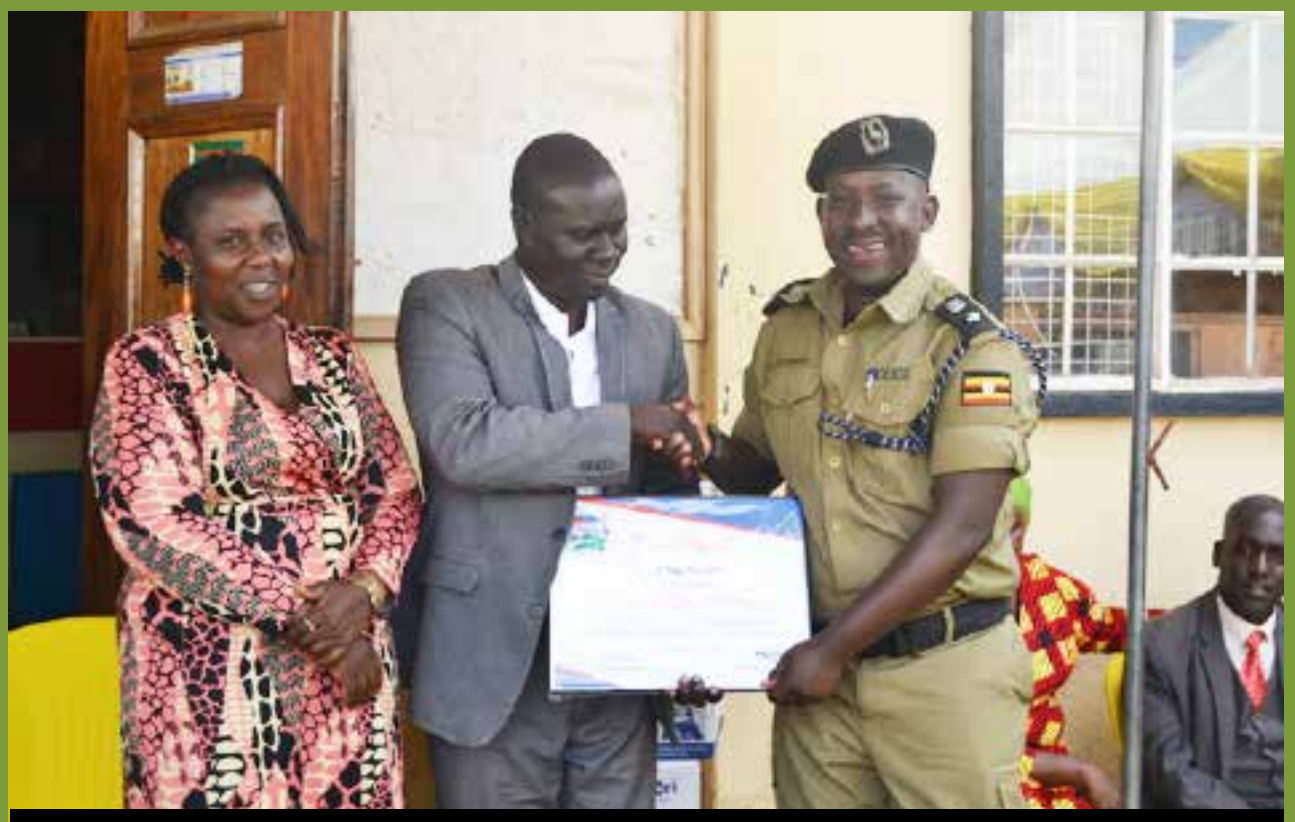
Rewarding the best: Ntoroko DPC receives an award from RAC during the 2018 ACW commemoration

outstanding individuals that had exhibited commitment in their work in a bid to fight against corruption and improve service delivery in their region. A total of 4 women and 4 men were given the awards. The convention further provided a platform for the leaders to respond to pending cases reported to RAC, as well as new corruption-related cases and service delivery gaps raised by the citizenry. A total of 22 pending cases at RAC, 11 corruption related cases and 38 service delivery gaps were presented/raised for response and action during the convention. Responses to these issues were given by relevant duty bearers/leaders in form of clarification, advice to the complainants and commitments to investigate further for logical conclusion.