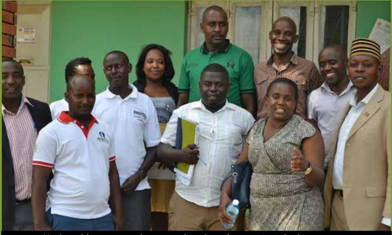
Members of the governance cluster pause for a photo after a meeting in Rwebisengo

15. Radio programmes: A total of seven radio talk-shows were conducted in the period under review: the first three talk shows were conducted in the districts of Kasese, Bundibugyo and Kamwenge to give feedback to the community on cases followed up by RAC while the other two radio talk shows were conducted on VOT and HITS FM in Fort Portal. The two talk shows in Kabarole district were offered to RAC by the office of the RDC to mobilize masses for the anti-corruption convention 2018. Radio endorsements (DJ mentions) and radio announcements were also conducted to mobilize the community to come and participate in the Anti-Corruption Convention