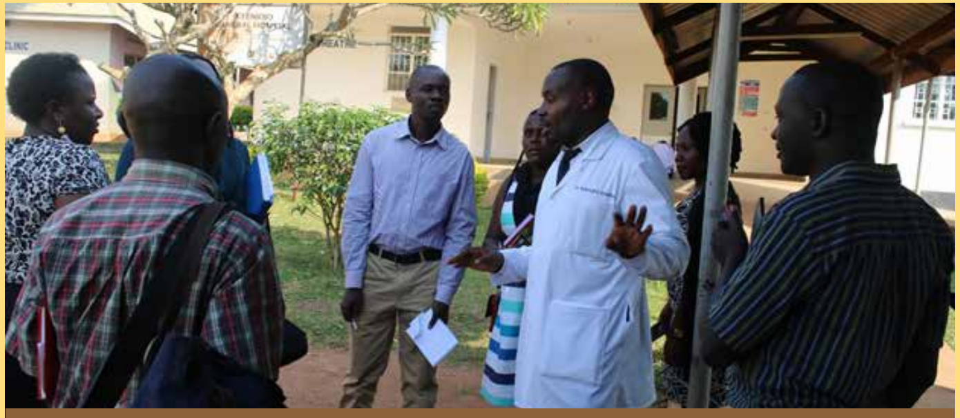
Cluster members inspecting a new latrine under construction at the hospital