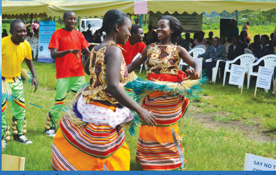
Engabu za Toro cultural group entertain participants at the anti-corruption convention 2012