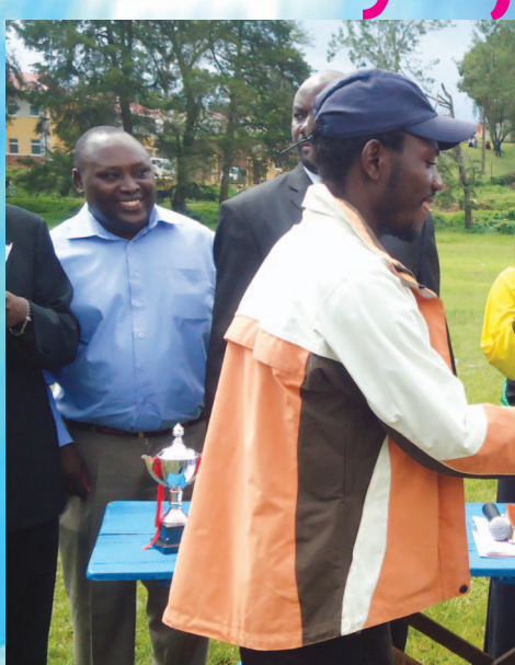
The Deputy RDC Kamwenge rewards