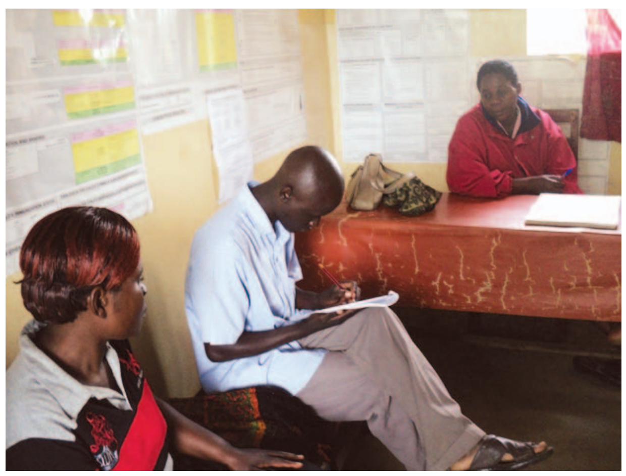
Monitors in an interview with the Karambi HC in-charge (Right)