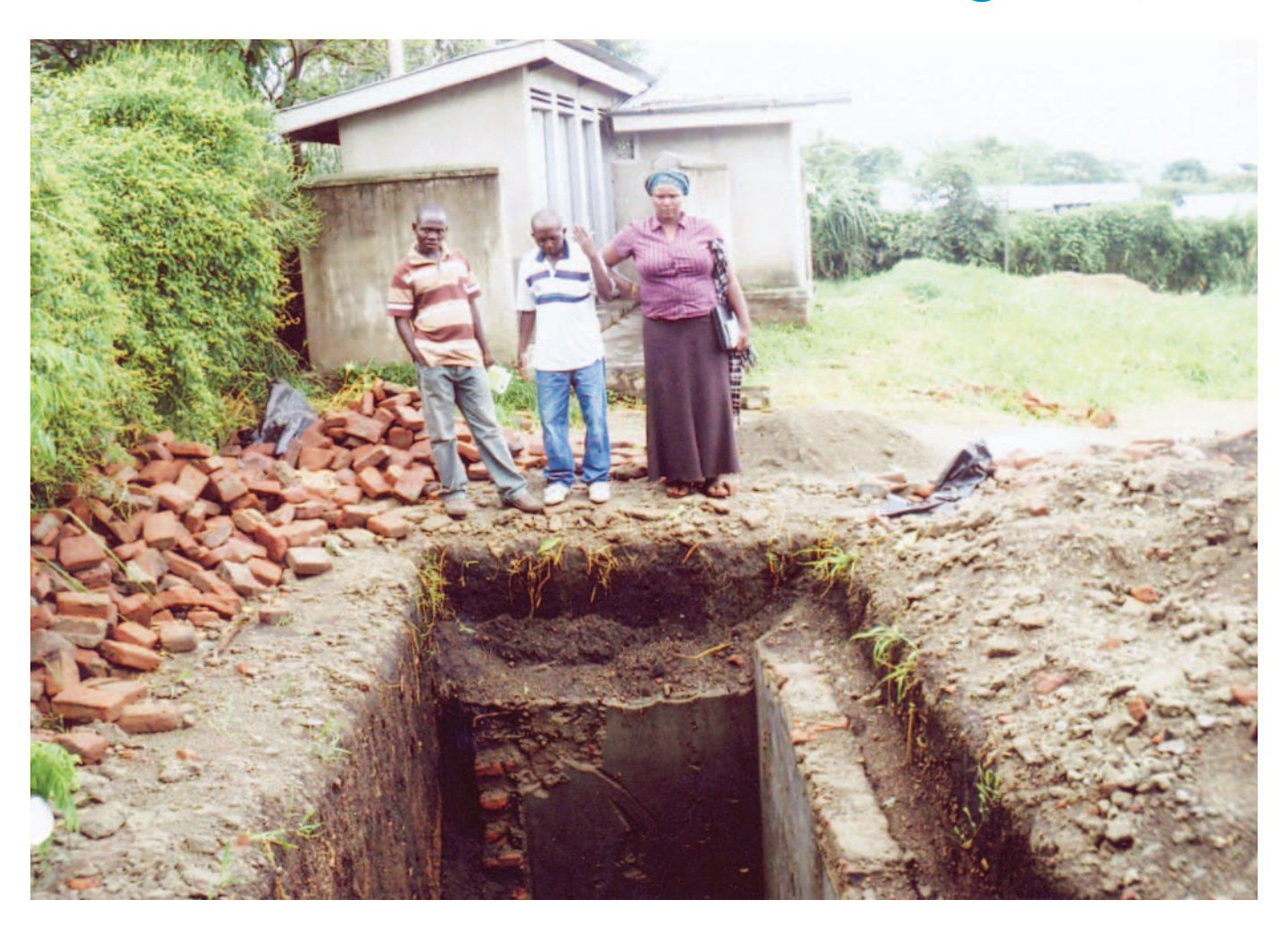
Part of the latrine collapising