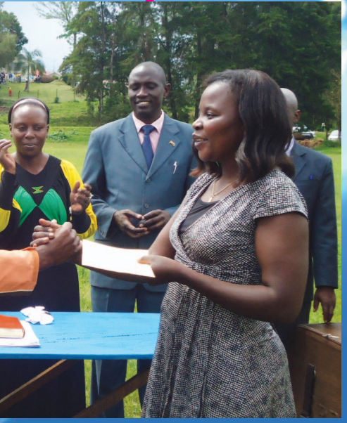
an Anti-corruption activist with a prize.