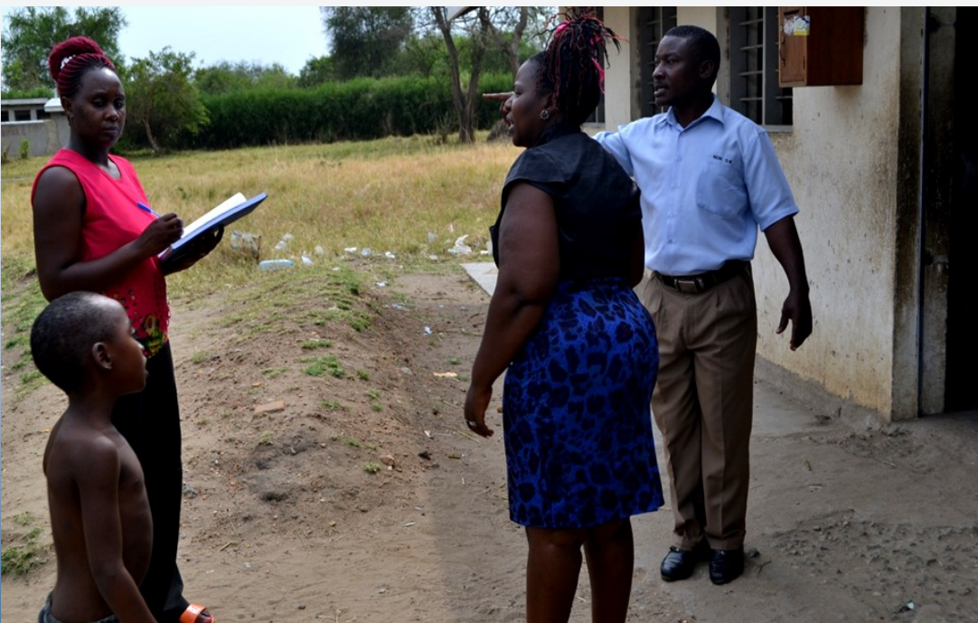
Figure 1: The RAC ED (C) and the Communications Officer (L) monitoring Kibuku Primary school in Ntoroko district; extreme left is the Head teacher of Kibuku P/s