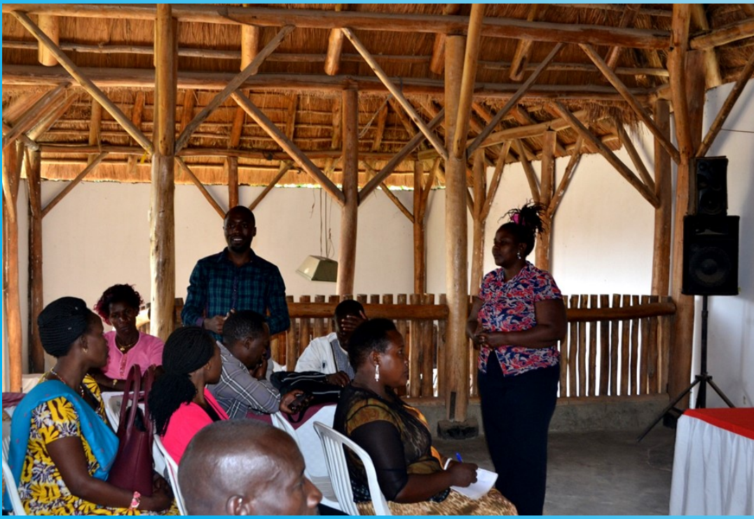
Figure 2: Kamwenge Town Council monitors in a training session