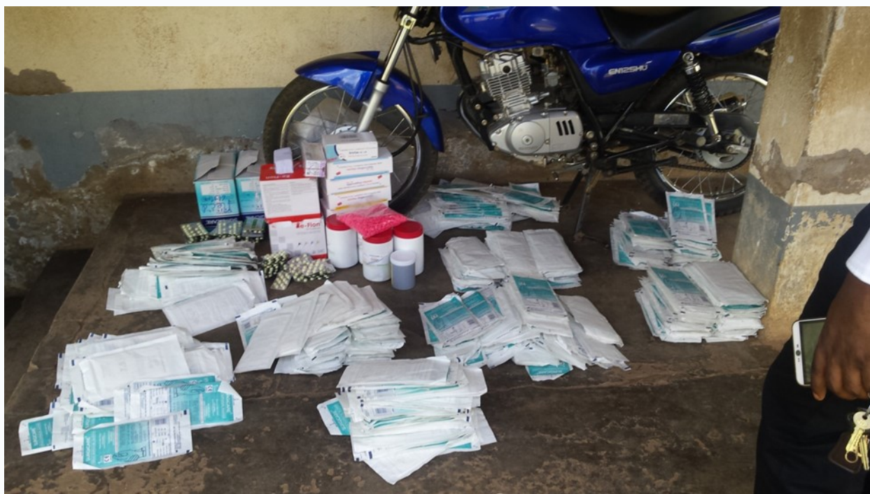
Figure 4: Sample of drugs intercepted on Kalita bus

One of the immediate results from this meeting was increased vigilance, having cautioned the community to monitor government services with a keen eye. A day after our DIPF meeting at Buhinga, a boda-boda rider who was hired by the hospital staff (mortuary attendant) to deliver stolen drugs and other medical supplies at a bus station quickly reported the matter to police and the office of the RDC, who then involved RAC to track down the culprit. The stolen drugs worth two million (approximately) were intercepted on a Kalita bus on the way to Kasese and are now in police custody, pending further investigations. Although the accused is still on the run, RAC has been commended by the district and hospital leadership, and the surrounding community for opening up their eyes on where to report cases of fraud and any other anomalies.