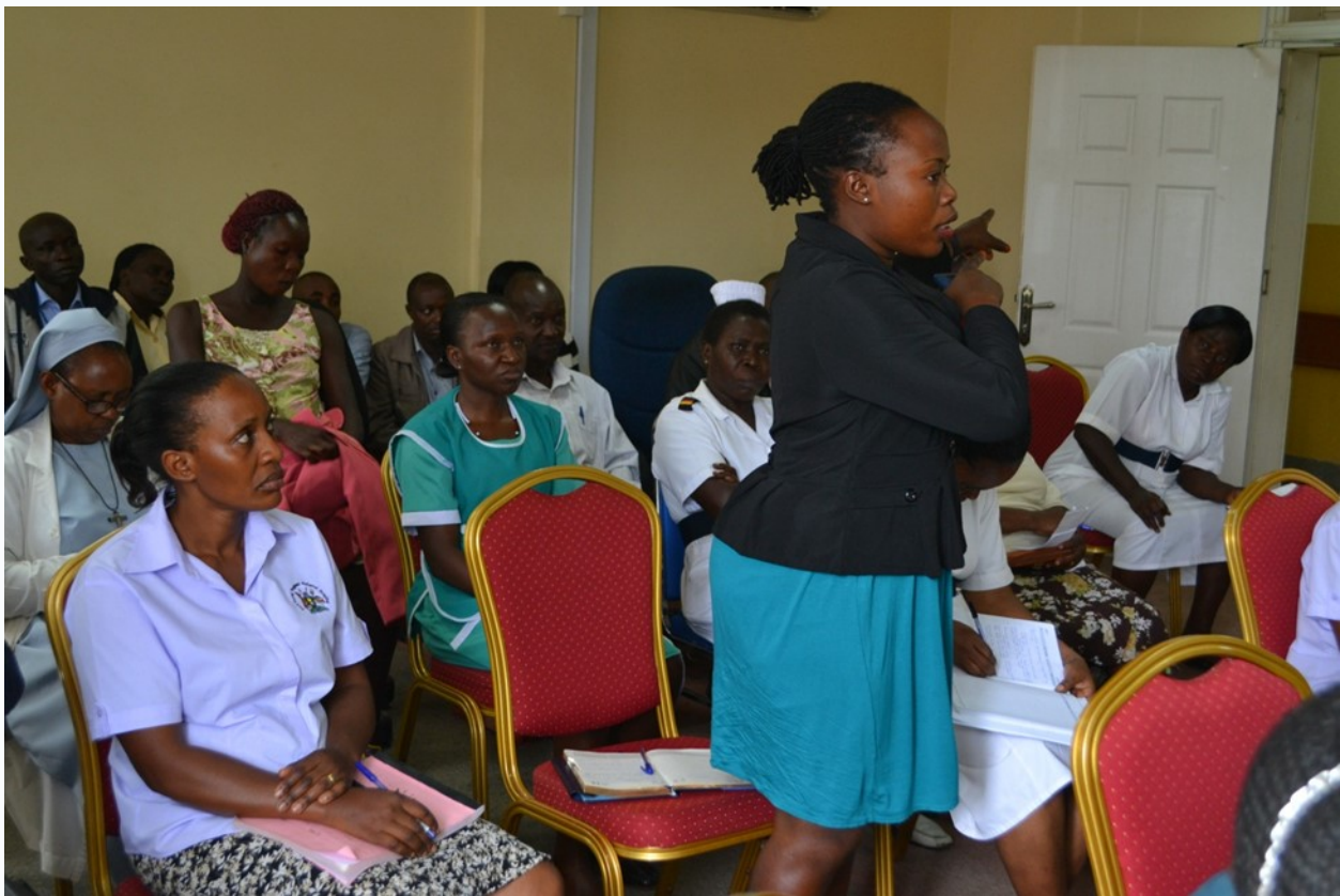
Figure 3: Participants during the joint meeting at Buhinga hospital

On March 17, 2017, RAC in conjunction with the office of the RDC and the DHO organized a one-day dialogue at Buhinga Regional Referral Hospital in Fort Portal, Kabarole district, with the main purpose of understanding the state of service delivery in the health sector in Kabarole, and the Rwenzori region at large. The dialogue brought together a total of 79 participants (49 women and 30 men) to discuss matters of health in Kabarole and the region at large. In attendance were the various departmental heads and medical staff of the referral hospital, RAC monitors, office of the DHO, grassroots communities and RAC staff. The meeting provided a platform for the hospital leadership to share their achievements, challenges and recommendations for the hospital. The Buhinga referral hospital staff were able to share their challenges and called upon RAC to organize an engagement meeting with the staff of the hospital in order to come up with key strategies through which the existing challenges can be addressed.